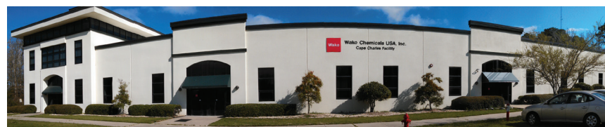
Wako Chemicals USA, Inc. - Cape Charles Bleeding Facility: Cape Charles, Virginia 23310

Wako Chemicals USA, Inc. is very much concerned with maintaining the viability of the horseshoe crab population. We are dedicated to following practices that ensure the careful handling and good quality of crabs used for LAL manufacture that both minimize injury and protect this invaluable species. After bleeding, the crabs are returned the next day by our fishermen to the same waters where they were collected. To assist in the collection of data for crab conservation studies, Wako USA participates in a horseshoe crab tagging and monitoring program coordinated by the U.S. Fish and Wildlife Service.